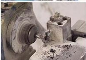
Pipe Cutting Process