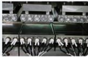
Glass Bending Machine