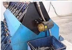
Tube Rolling Process