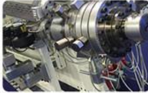
Injection Molding Machine